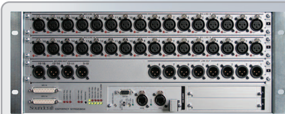
The Compact Stagebox comes complete with twin redundant power supplies, thermostatically-controlled fan cooling and full LED status monitoring. The Compact Stagebox is connected to the host console using either Cat-5 or Optical-fibre MADI.

Si Compact is compatible with the full range of Soundcraft and Studer I/O systems. One example is the Compact Stagebox, and this adds a cost-effective expansion option for the SI Compact. The Soundcraft Compact Stagebox offers a high density of I/O connections in only 4U of rack space. The modular unit is fully configurable but is offered with a standard configuration of 32 mic/line inputs, 8 line outputs, 8 channels of AES/EBU outputs and 2 expansion slots for standard Soundcraft Studer D21m I/O cards. The D21m is the I/O architecture for Studer as well as Soundcraft digital mixing systems and allows connection to most popular digital formats, including CobraNet®, AVIOM A-Net®16, EtherSound, ADAT and RockNet. A MADI recording interface can also be fitted to the expansion slots.