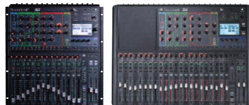
Available in 16 channel (19"), 24 and 32 channel versions

And a new security mode prevents unauthorised access to key functions. In addition to 'total lockdown', security can be tailored for different 'operator access' levels – for example locking out house EQ and processing for guest engineers whilst, allowing access for in-house operators.